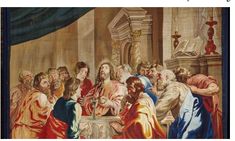
Institution of the Eucharist, tapestry by Rubens now features in our Pavilion at Expo Milano.

The Council for Coordination of the Pontifical Academies met to make its selection for its Prize on 2 July.